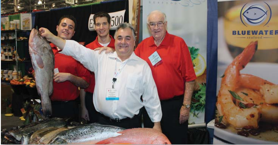
Exhibit Booth Costs & Features