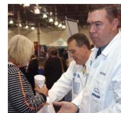
Exhibit Space Contact